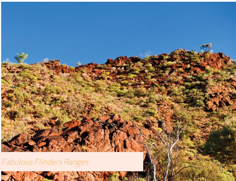
Fabulous Flinders Ranges