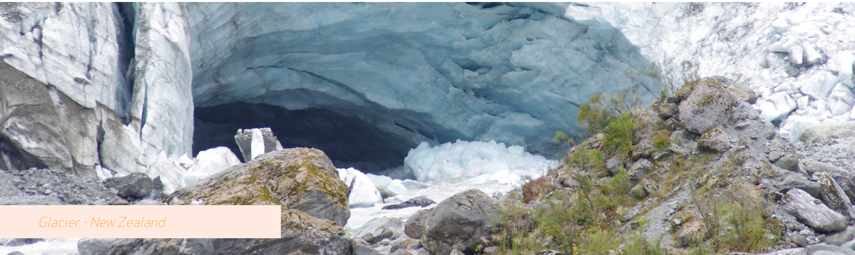
Glacier - New Zealand