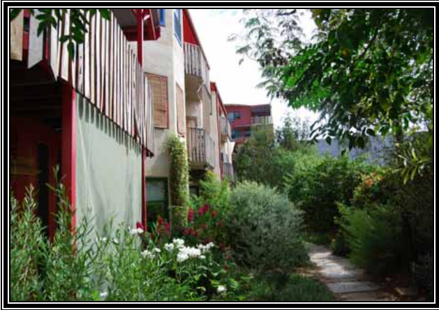
Christies Walk Sustainable Village