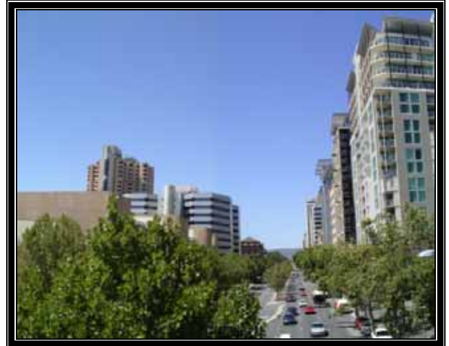
North Terrace Adelaide